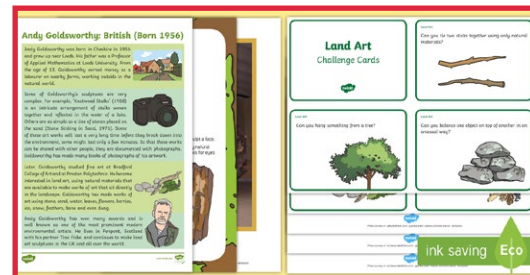
Outdoor Art - Goldsworthy Inspired Art Ideas Resource Pack